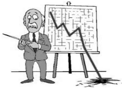
Figure 1: An economist (TEXT, cambria 11, only black-and-white)