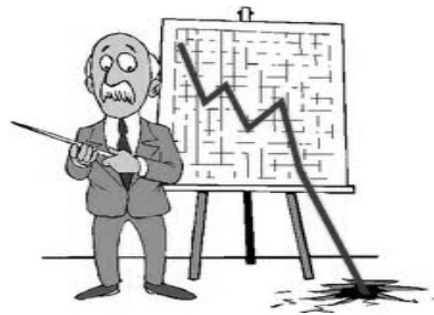
Figure 2. Public revenue