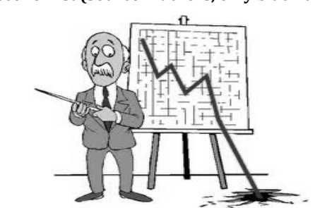
Figure 1. An economist (Source: Authors, only black-and-white)

(TEXT) All figures should be numbered with Arabic numerals (1,2,...n). All photographs, schemas, graphs and diagrams are to be referred to as figures. Figures must be embedded into the text and not supplied separately. Lettering and symbols should be clearly defined either in the caption or in a legend provided as part of the figure. Figures should be placed at the top or bottom of a page wherever possible, as close as possible to the first reference to them in the paper.