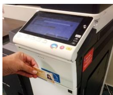
Login with an ISIC card