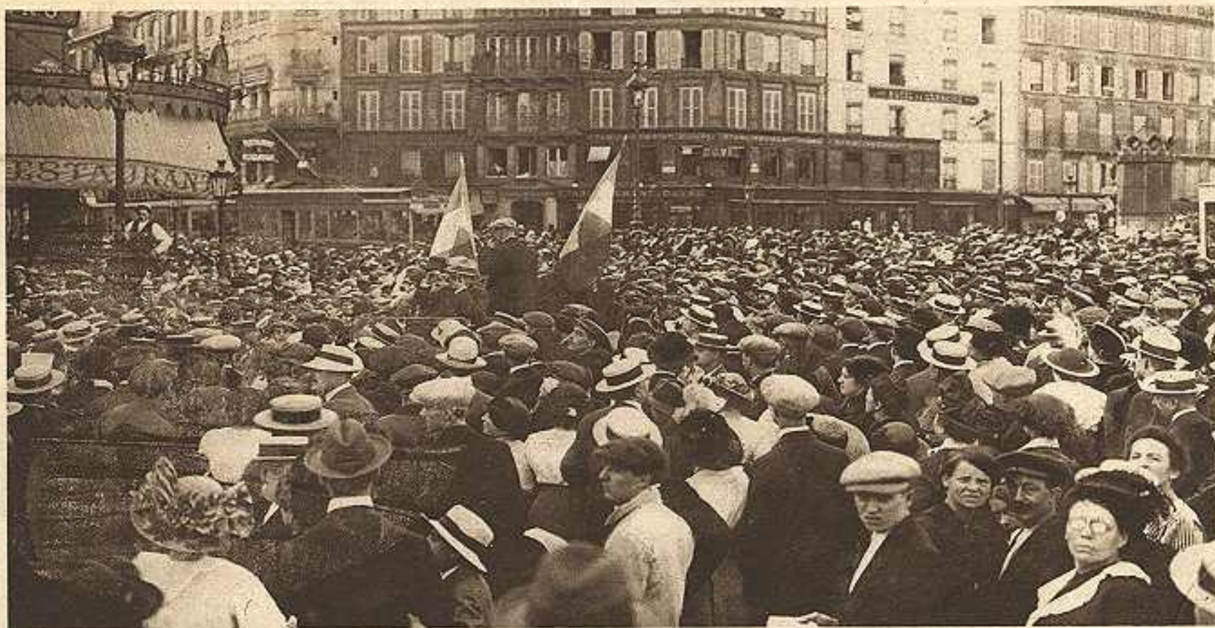
LA FOULE ÉMUE ET VIBRANTE ASSIÈGE LA GARE DE L'EST

Dimanche 2 août 1914... une date qui restera historique. Quarante-quatre ans après la mobilisation fiévreuse qui devait aboutir à un désastre, nos hommes s'en sont allés, admirables de sang-froid et de confiance, vers la frontière. A la gare de l'Est, le spectacle