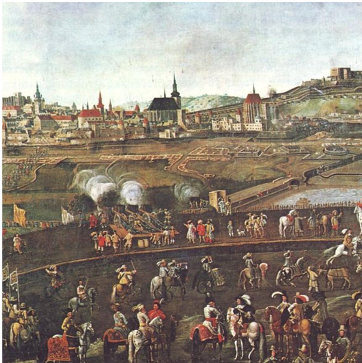
Unsuccessful siege of Brno by Swedish army in 1645