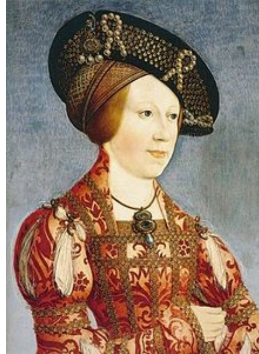
Anne of Hungary and Bohemia