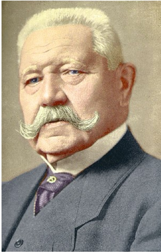
Paul von Hindenburg