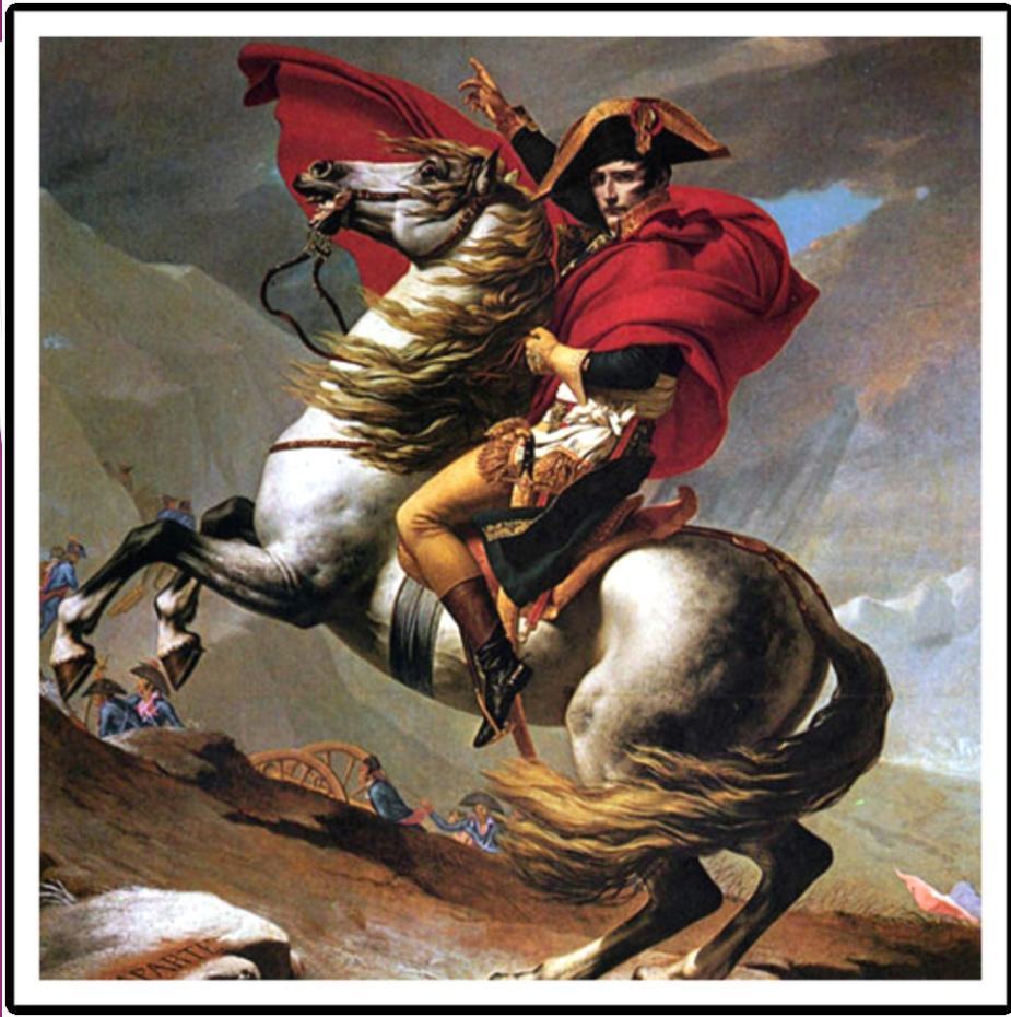
Napoleon by Jacques-Louis David