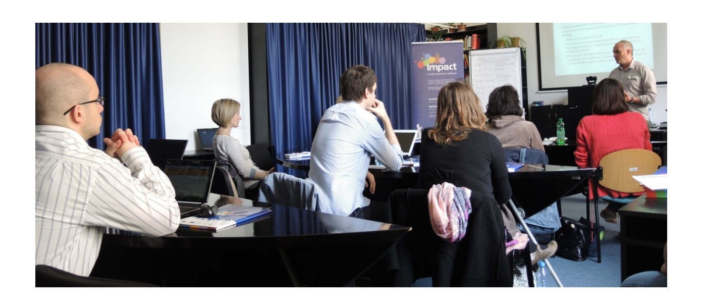
The Organisational Team