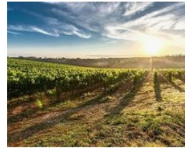
Česká republika - Jižní Morava - Ce... afis.cz