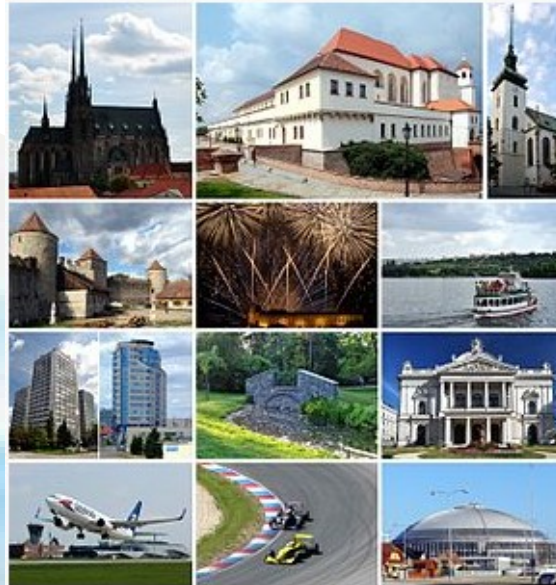
Montage of Brno

• Left, row 1: Cathedral of St. Peter and Paul on Petrov hill • Left, row 2: Veveří Castle • Left, row 3: High-rise buildings • Left, row 4: Brno-Tuřany International Airport • Middle, row 1: Špilberk Castle • Middle, row 2: Ignis Brunensis international firework competition • Middle, row 3: Park Lužánky • Middle, row 4: Masaryk Circuit, the Brno racing circuit • Right, row 1: Church of St. James • Right, row 2: A ship on Brno Reservoir • Right, row 3: Mahen Theatre, a part of the National Theatre in Brno • Right, row 4: A part of the Brno Exhibition Centre