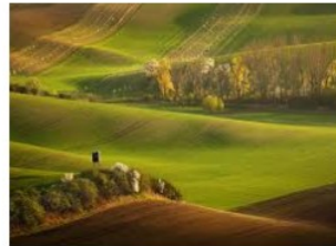
Moravská jarní pole - Jižní Morava (Česk...