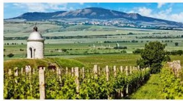
Jižní Morava: jídlo, wellness i vinařská akademie |... slevomat.cz