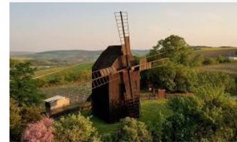
Jižní Morava - Tradice má smysl tradicemasmysl.cz