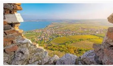
Jižní Morava v penzionu s degustací a neomezenou k... slevoteka.cz