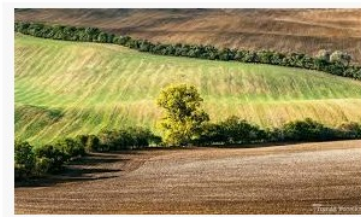
Jižní Morava zklamala. Má málo zeleně, hodně odpa... idnes.cz