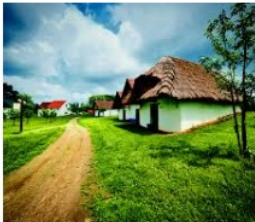
Obliba jižní Moravy z pohledu turí... m.budejckadrba.cz