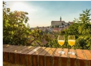
DAEN - Česko - Jižní Morava daen.cz