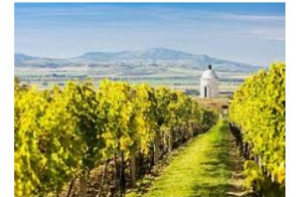
JIŽNÍ MORAVA S VÝLETY, Česko - dovol... zajezdy.cz