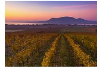
Jižní Morava je nejpůvodnější destinac... m.brnenskadrba.cz