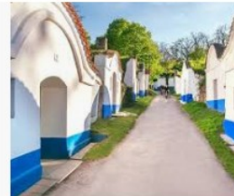
Jižní Morava - Naši milí příznivci, v... facebook.com