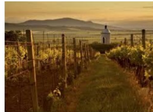
Kudy z nudy - Jižní Morava kudyznudy.cz