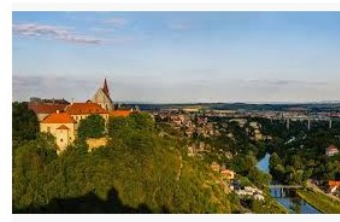
Jižní Morava: nejlepší výlety i s dětmi, kde nen... prozeny.cz