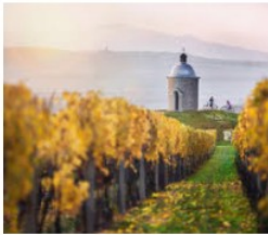
Jižní Morava | Země filmů zemefilmu.cz