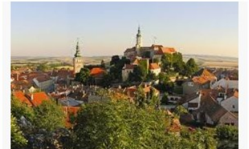
Jižní Morava | CK Fede fede.cz