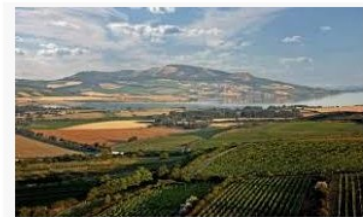
Dovolená jižní Morava - Pálava | Apartmán Cabernet apartmancabernet.cz