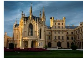
Jižní Morava je pro dovolenou jako stvořen... jenprocestovatele.cz