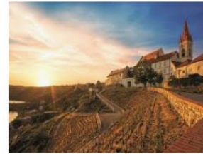
Obliba jižní Moravy z pohledu turistů k... m.libereckadrba.cz