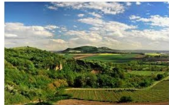
Jižní Morava a její největší krásy - ČeskoSlo... ceskoslovensko.cz