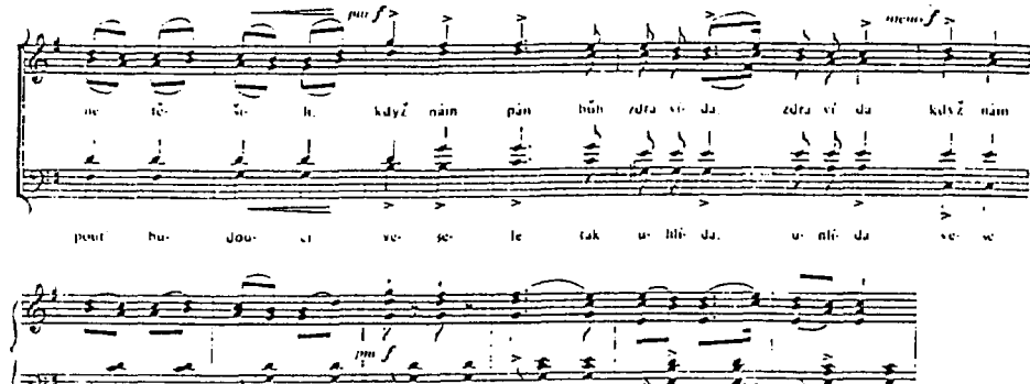
Example 8: Smetana, The Bartered Bride, act I, sc. 1.