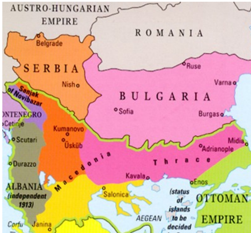
1st Balkan War