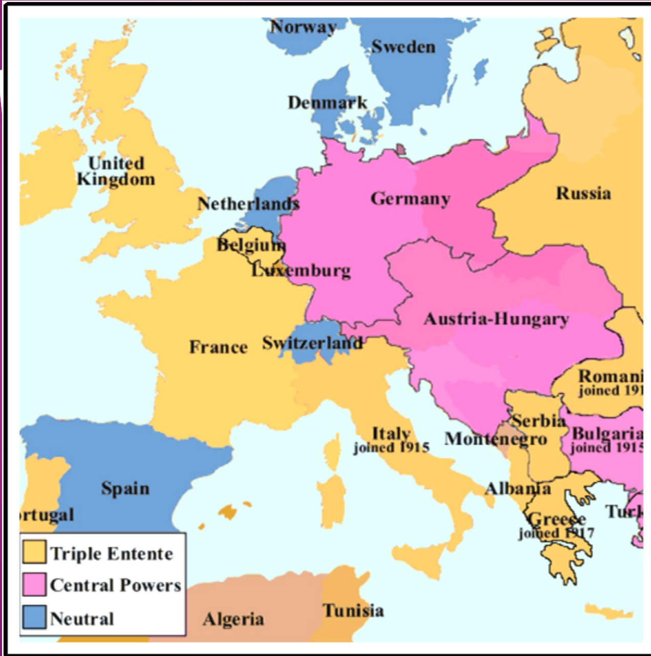
The blocs of Powers