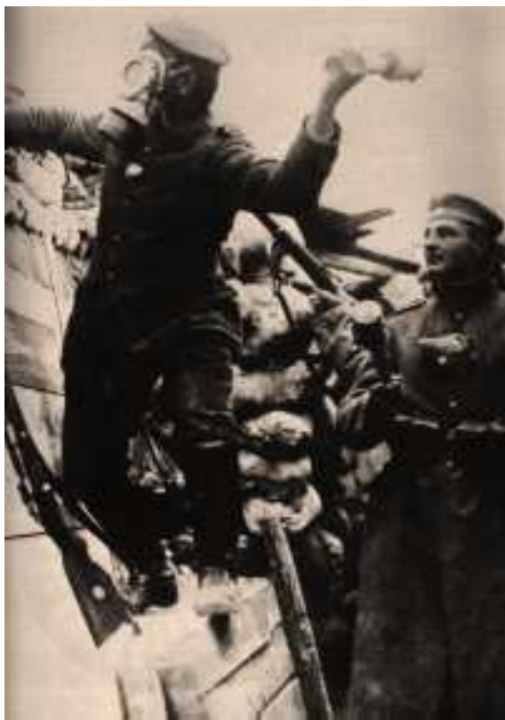
The Second Battle of Ypres