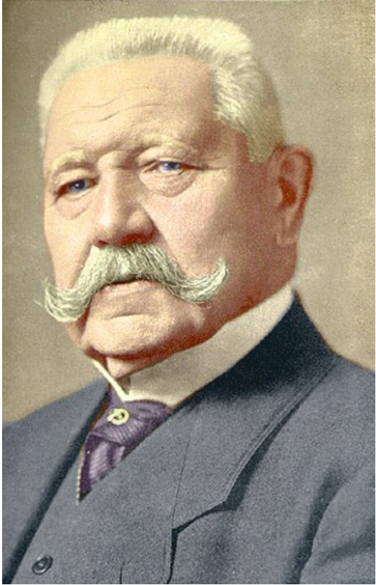
Paul von Hindenburg