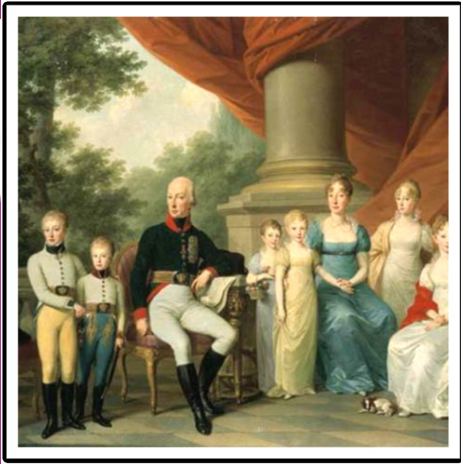
Emperor Francis and his Family, a portrait by Jozef Kreutzinger