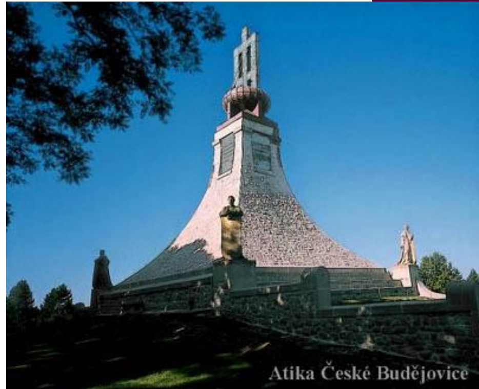
Cairn of Peace