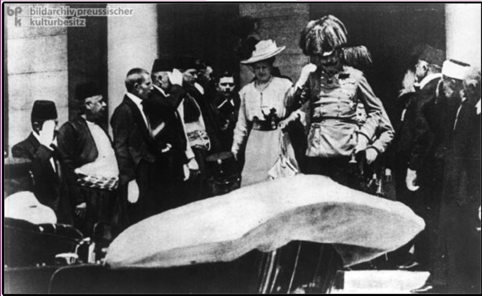
Archduke Franz Ferdinand and his wife Sofia in Sarajevo.