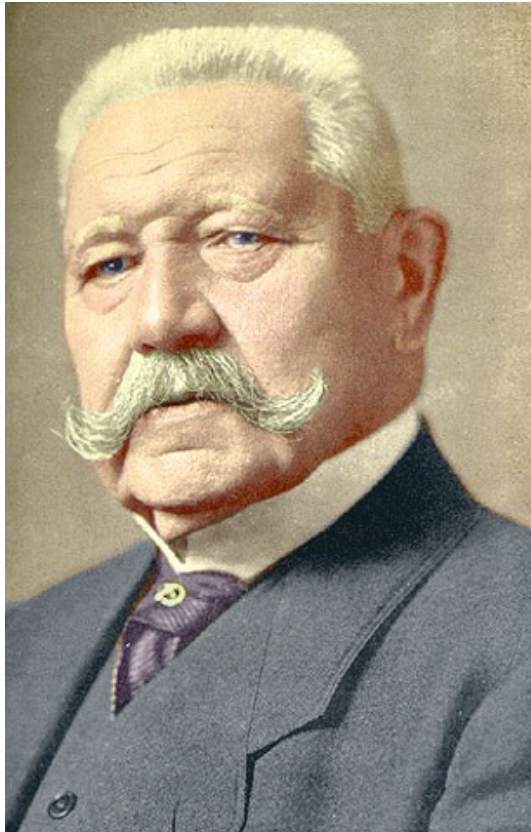
Paul von Hindenburg