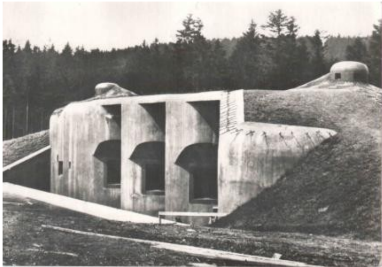
Czechoslovak fortification - Hanička http://www.hanicka.cz/