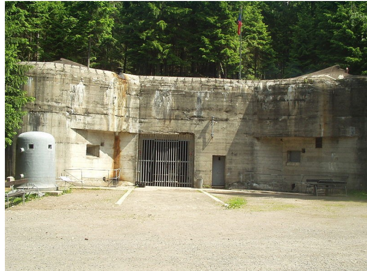
Czechoslovak fortification - Bouda http://www.boudamuseum.com/