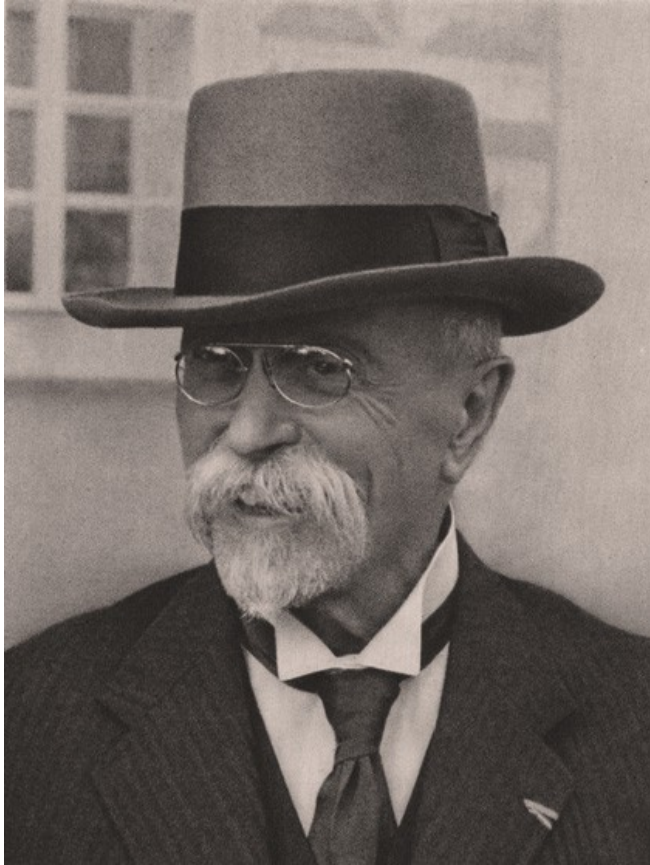
Tomaš Garrigue Masaryk