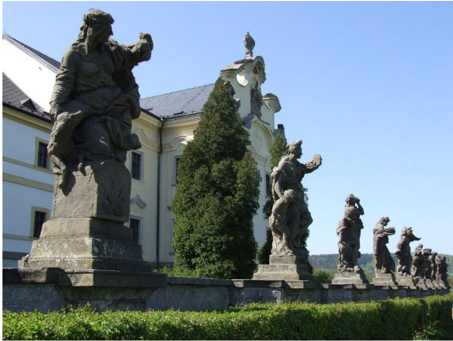
Kuks (western Bohemia) – Matyas Bernard Braun