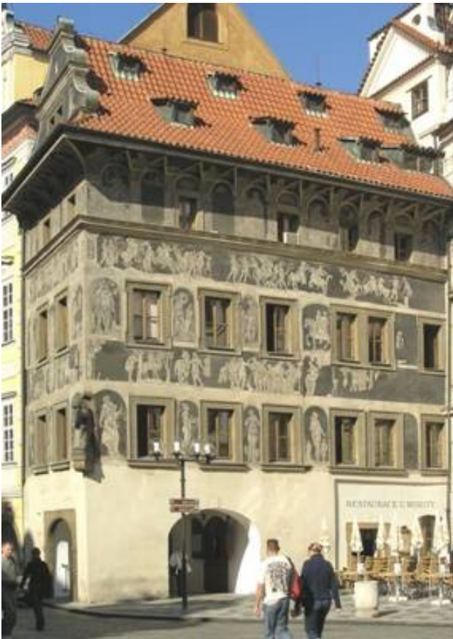
The house at the Old Town Square in Prague