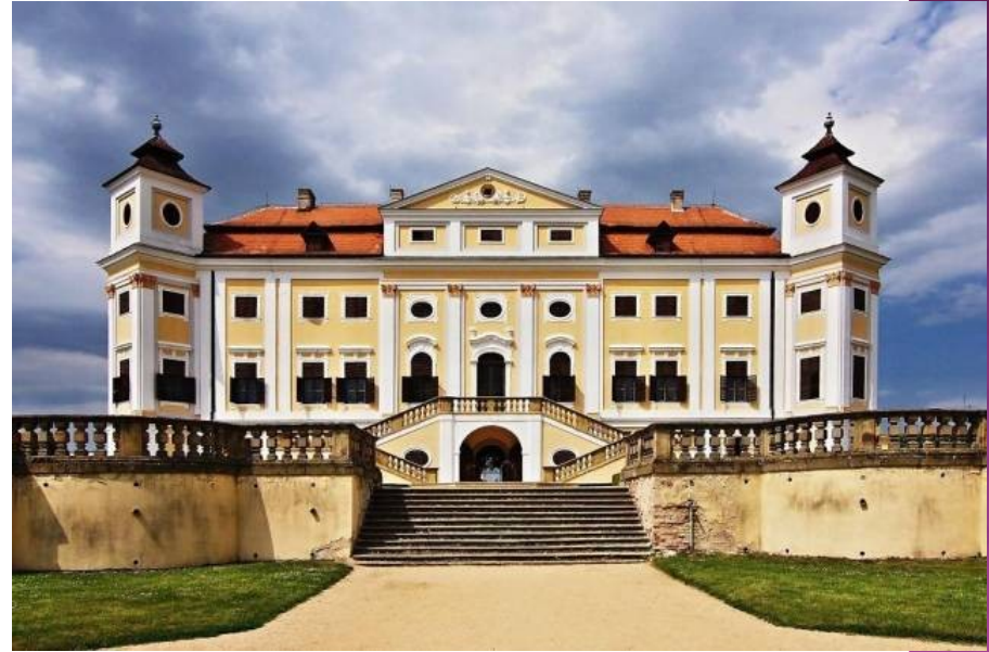
Chateau Milotice (southeastern Moravia) - Josef Emanuel Fischer von Erlach

http://www.zamekmilotice.cz/virtualni-prohlidka-2/