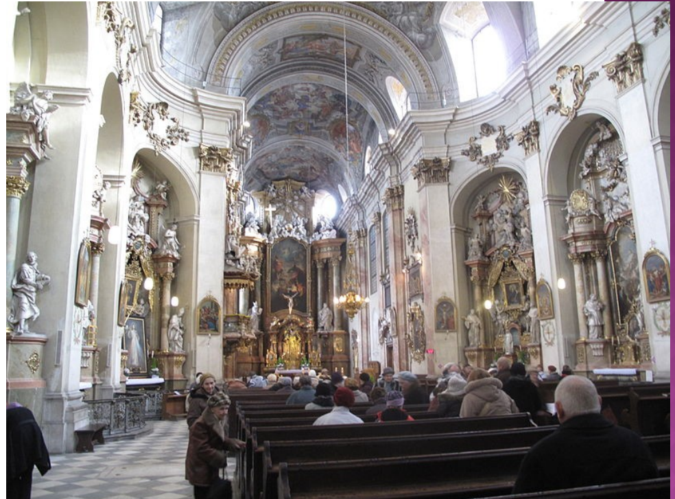
St. Johns' Church, Minoritská street, Brno