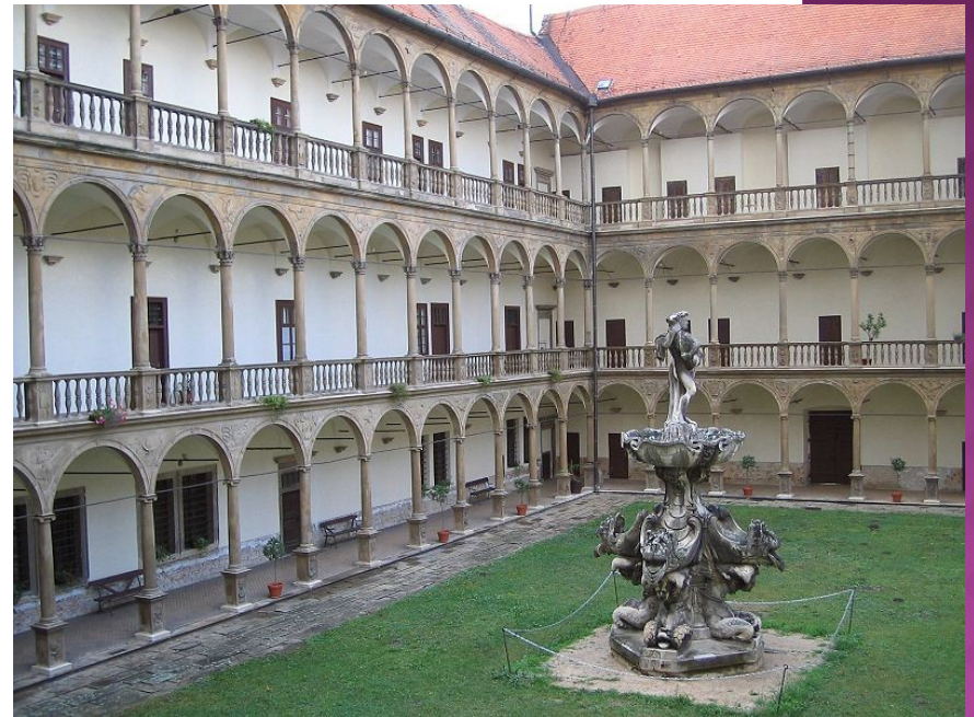
Chateau of Bučovice