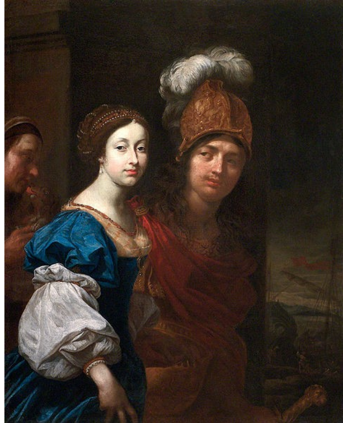
Karel Škréta - Paris and Helen