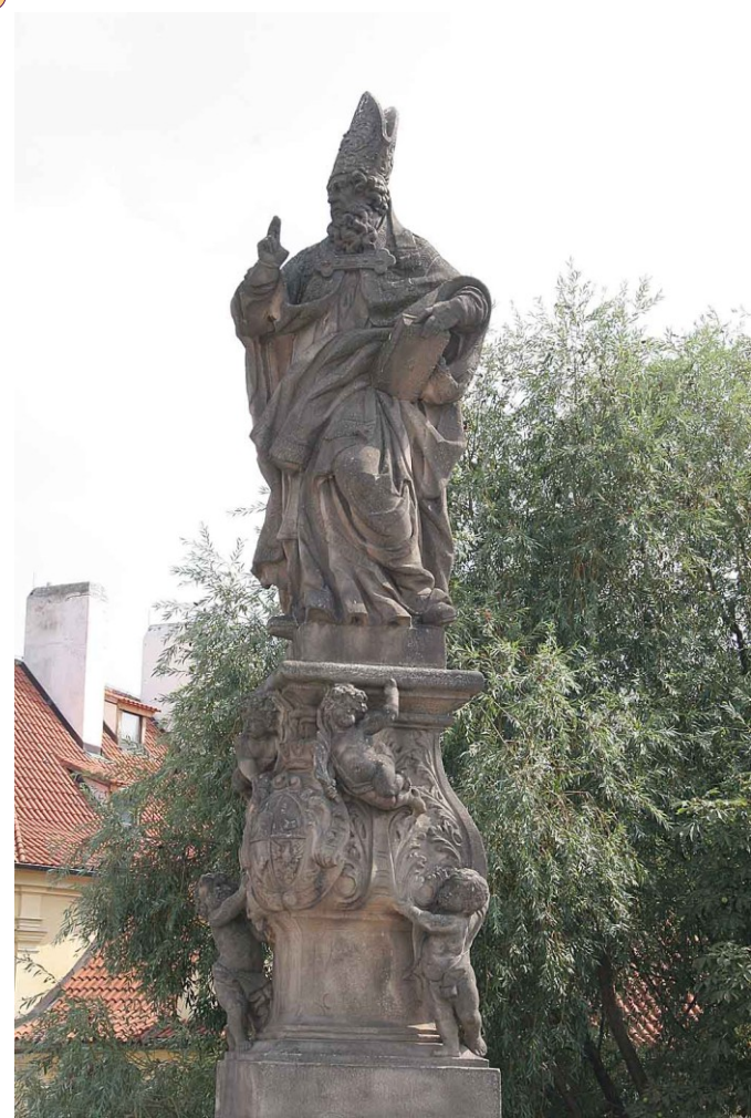
Charles Bridge (Prague) – St. Adalbert – F. M. Brokoff