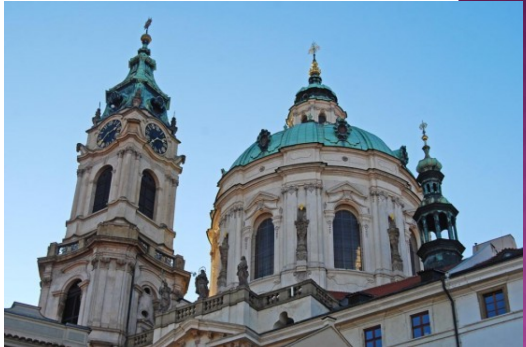
Prague – St. Nicholas Church – Christof and Kilian Ignac Dienzenhofer