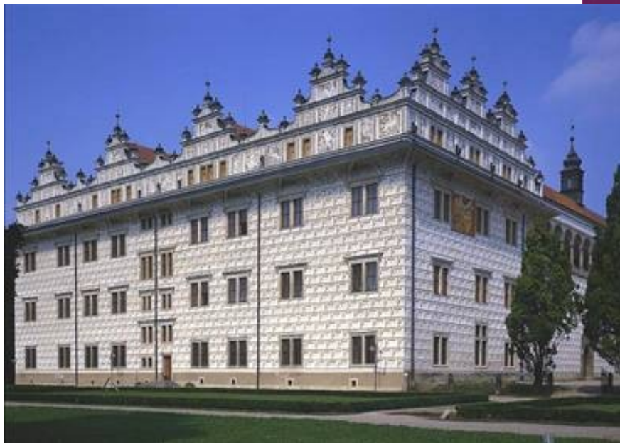
Chateau of Litomyšl