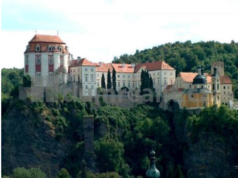
Chateau Vranov nad Dyjí (southern Moravia) – Jan Bernard Fischer von Erlach