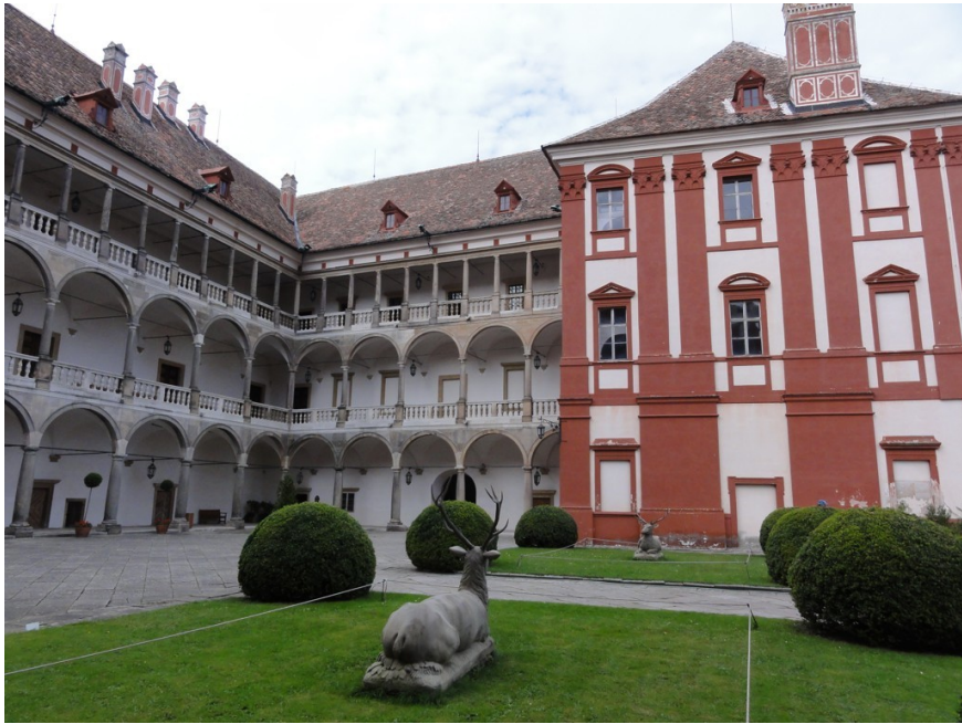
Chateau of Opočno