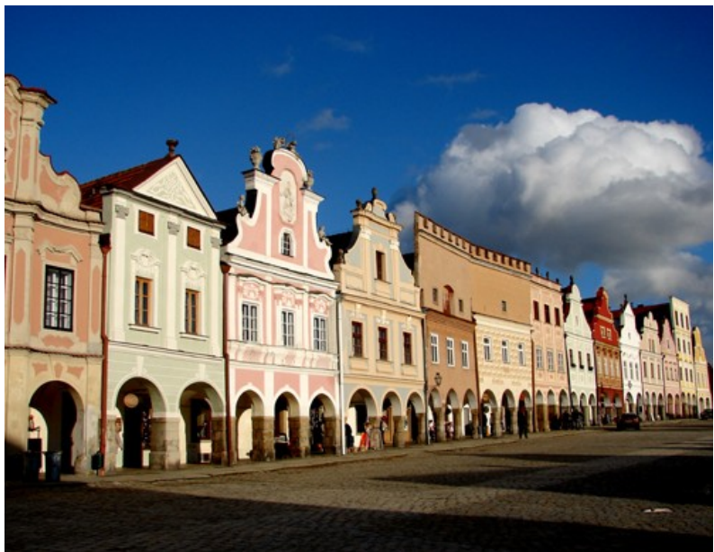
The Town of Telč