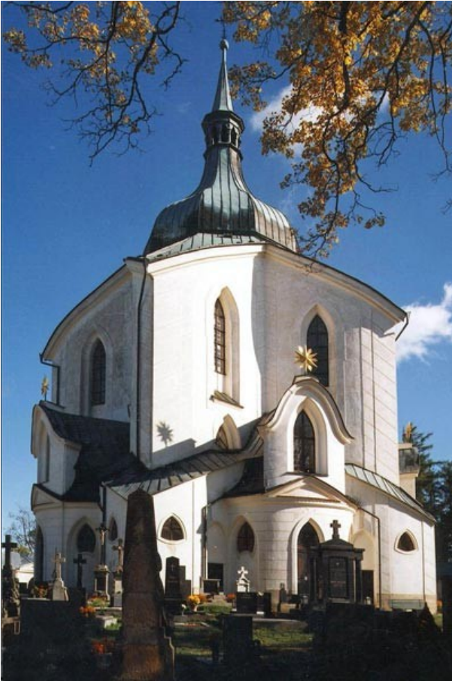
Pilgrimage Church of St John of Nepomuk on Zelena hora Hill