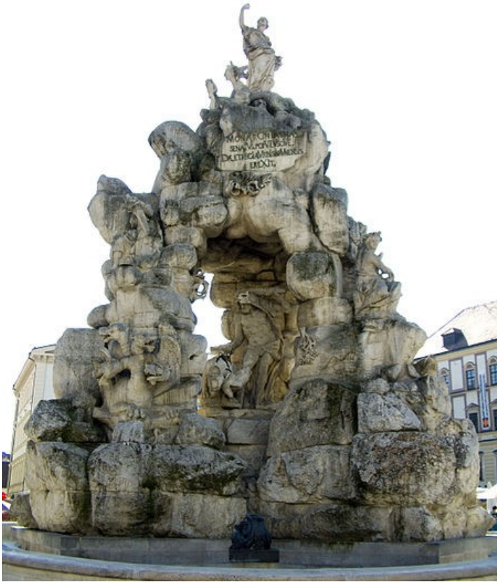
Green Market - The Parnas Fountain - Johann Bernhard Fischer von Erlach