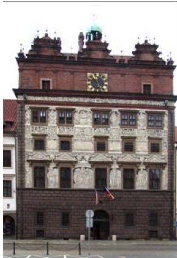
The Town Hall in Pilsen