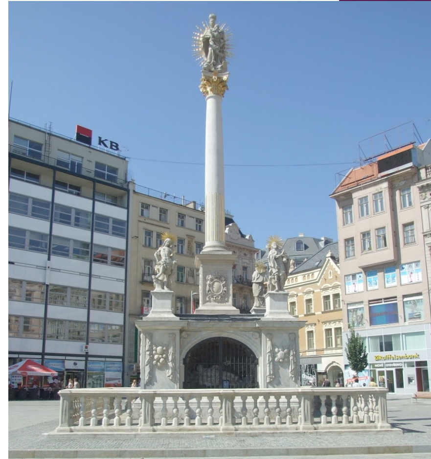
The Plague Column Square Svobody