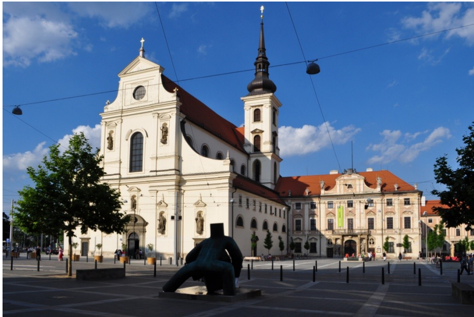
St. Thomas' Church – Moravské Square