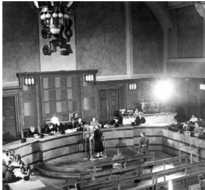
Figure 14: Dr. Milada Horáková facing her accusers

We lengthily discussed what is called the “Conviction.” Because it is by my conviction that my acts were justified. I must say that the Security of the State and the bodies expressed more patience to convince me, whereas me, I was much less patient, after February 48, to convince itself that violence and the injustices which were at the origin of my acts were real or momentary. I would lie by saying that I changed, that I am very different, that my conviction changed. That would be neither true, nor honest.