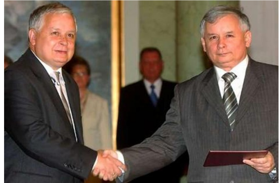
Jarosław Kaczyński and Lech Kaczyński