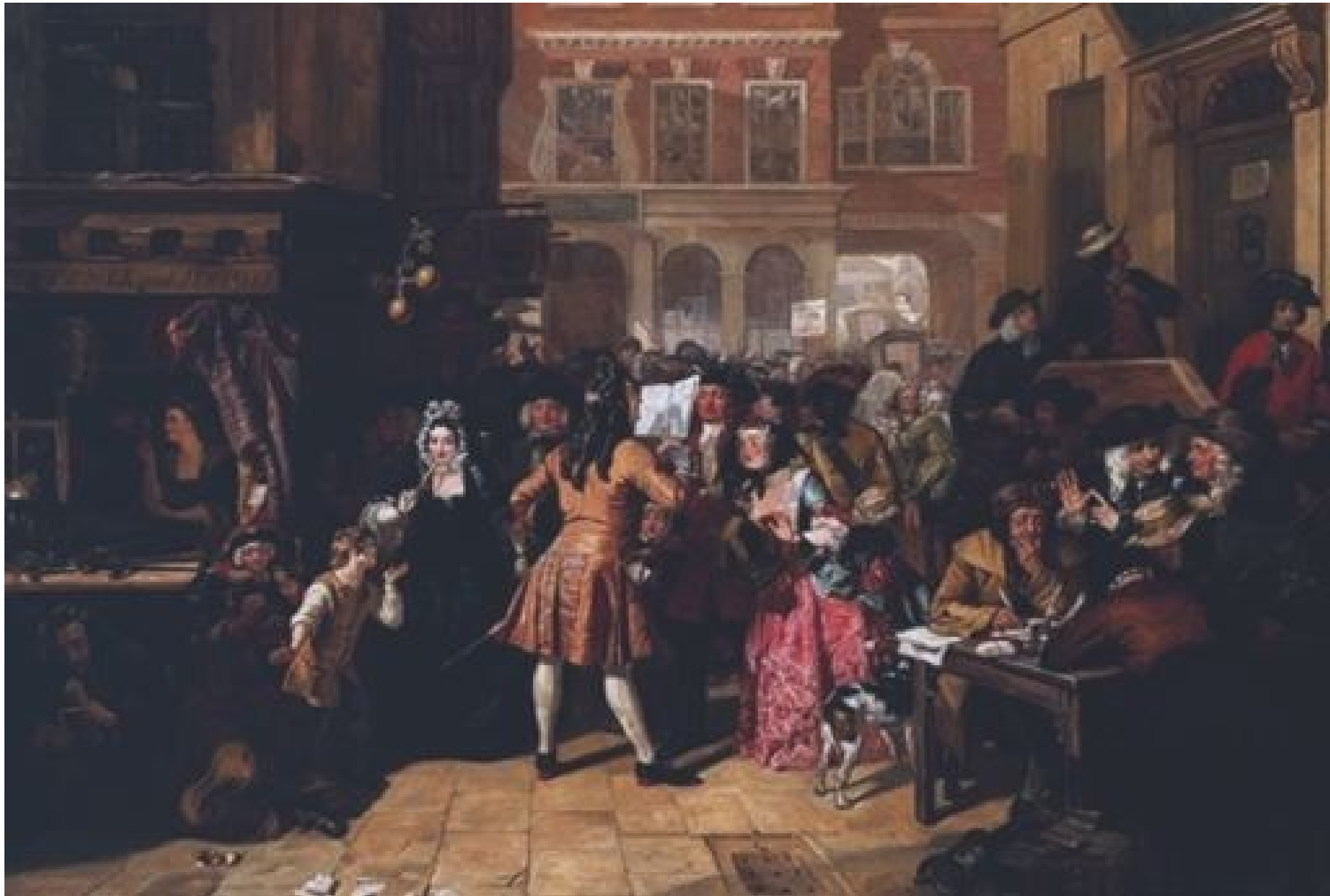
"South Sea Bubble", by Edward Matthew Ward