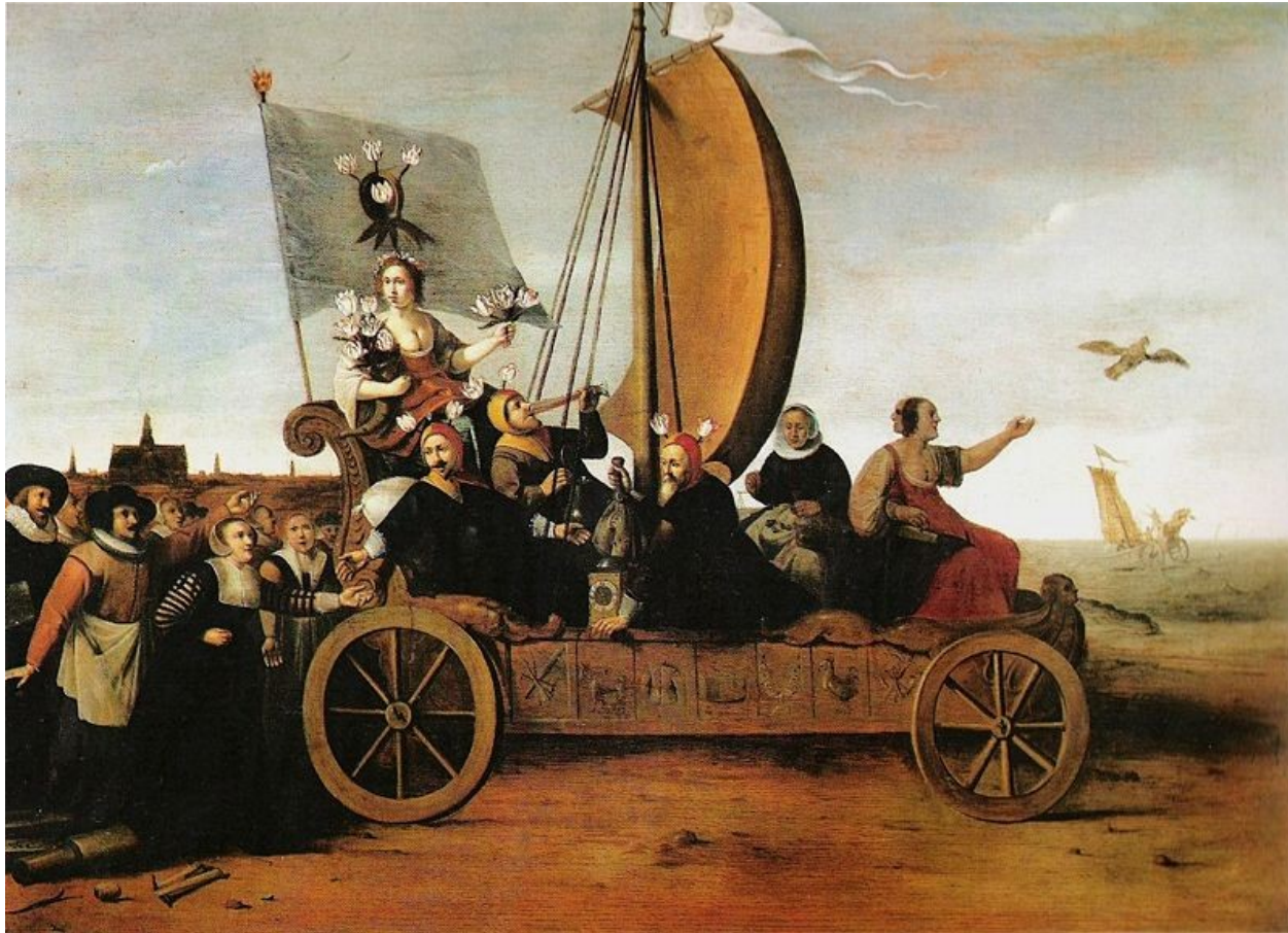
An allegory of tulip mania by Hendrik Gerritsz Pot, circa 1640.