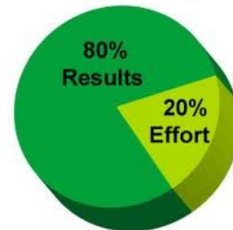
The Pareto Principle