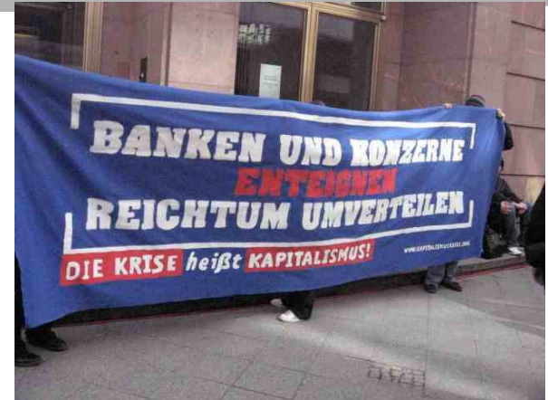
Organized demonstration outside Hertie School, expert discussion within, both part of the nonprofit sector...