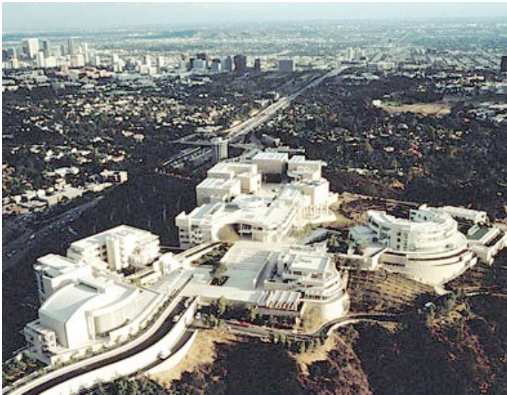
Bird's eye view of the Getty- Center, founded by G. Paul Getty...