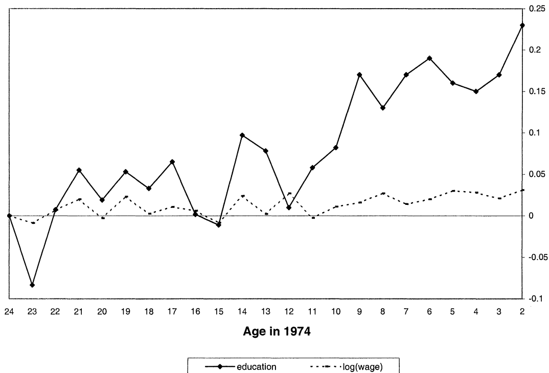
FIGURE 3. COEFFICIENTS OF THE INTERACTIONS AGE IN 1974* PROGRAM INTENSITY IN THE REGION OF BIRTH IN THE WAGE AND EDUCATION EQUATIONS

with valid wage data. Thus, on average, the program caused a 3 to 7 percent increase in the wages of this cohort.