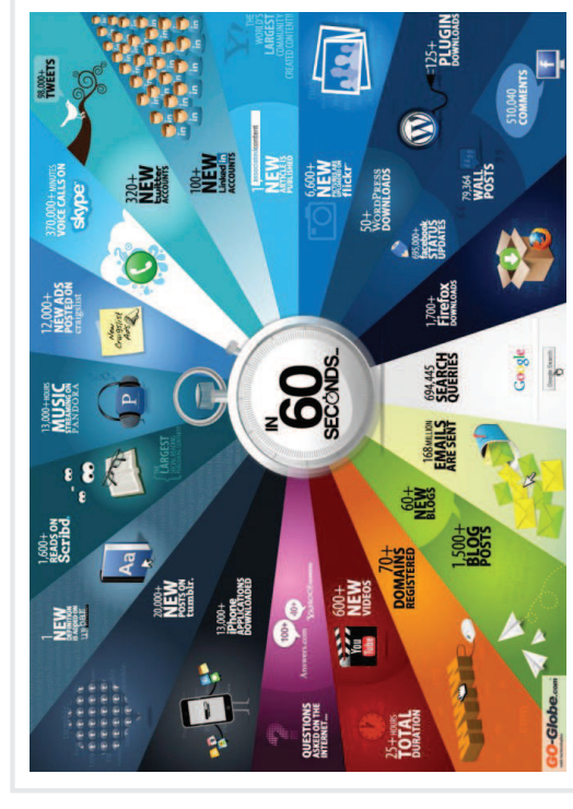
Figure 1. Internet activity in one minute in 2012. (Go-Gulf, 2012)

What new developments have happened recently? Keep an eye on the news for digital updates.