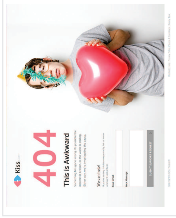
Figure 3. A fun custom 404 page from Kiss.com.

You can find a full list of status codes at www.w3.org/Protocols/rfc2616/rfc2616-sec10.html .