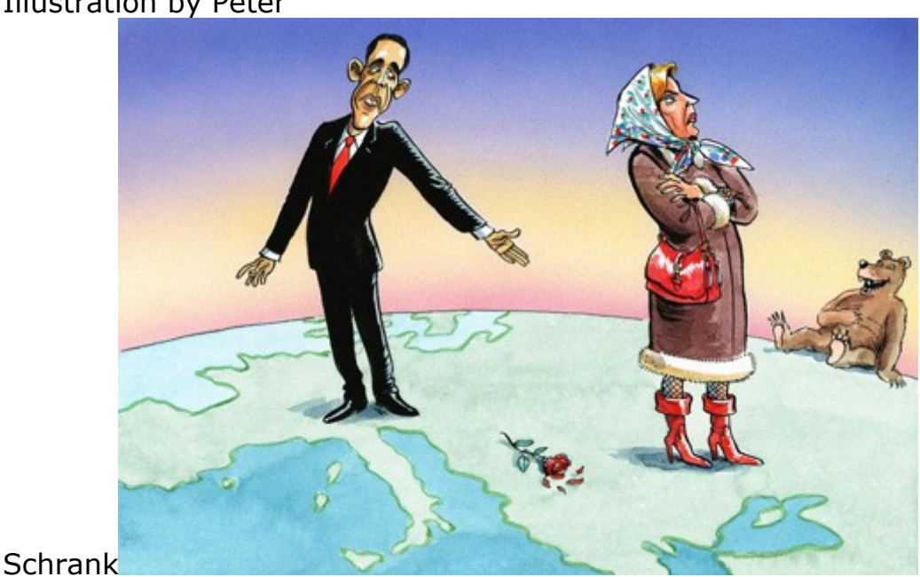
Illustration by Peter

AFTER two decades of sometimes fervent Atlanticism in the ex-communist world, disillusionment (some would call it realism) is growing. At its height the bond between eastern Europe and America was based, like the best marriages, on a mixture of emotion and mutual support. The romance dates from the cold war: when western Europe was sometimes squishy in dealing with the Soviet empire, America was robust. When the Iron Curtain fell, ex-dissidents and retired cold warriors found they had plenty in common. America pushed for the expansion of NATO, guaranteeing the east Europeans' security. In return, ex-communist countries loyally supported America, particularly in providing troops for wars in Iraq and Afghanistan.