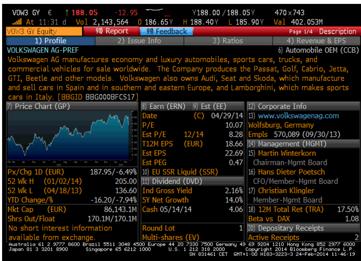
Figure 1: Bloomberg screen for the equity