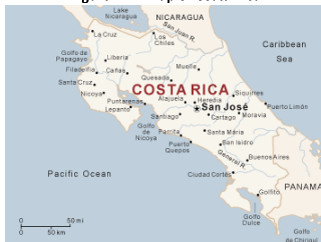
Figure N°1. Map of Costa Rica

The Republic of Costa Rica is a Central American country that has a boarder with Nicaragua in the north and Panama on the southeast, it has access to both the Pacific Ocean and the Caribbean Sea, it has a presidential and constitutional government. The Gini coefficient per person for 2016 was 0,52, the life expectancy is around 80 years, the unemployment rate for 2016 is 9,70% and the GDP per capita for 2015 was around $10.877,2.