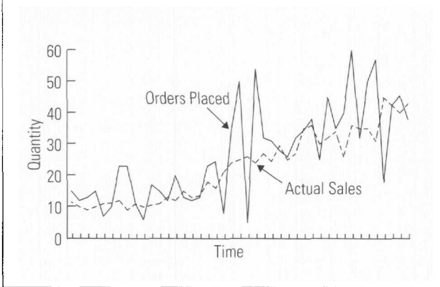
Figure 2 Higher Variability in Orders from Dealer to Manufacturer than Actual Sales

tory, but the company may not immediately place an order with its supplier. It often batches or accumulates demands before issuing an order. There are two forms of order batching: periodic ordering and push ordering.