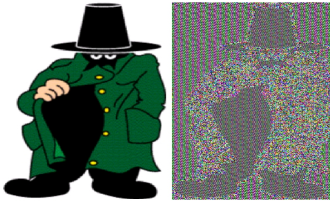
Figure 1. Result of statistical analysis on image encrypted in ECB mode

The FDE can be implemented on hardware layer (disks encrypted internally, encryption inside controller chipset) or in software [FDE]. Software implementation is for example Bitlocker for Windows systems, dm-crypt in Linux, FileVault on MacOS or TrueCrypt as a multiplatform solution. There are many other tools implementing this functionality [COMP].