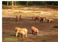
A herd of elephants walking across a dry grass field.