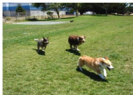
Two dogs play in the grass.