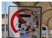
A refrigerator filled with lots of food and drinks.