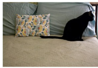
A close up of a cat laying on a couch.