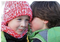
A little girl in a pink hat is blowing bubbles.