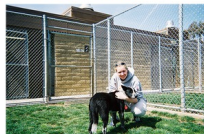
A dog is jumping to catch a frisbee.