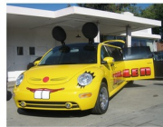
A yellow school bus parked in a parking lot.