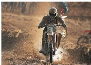
A person riding a motorcycle on a dirt road.