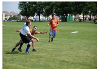
A group of young people playing a game of frisbee.