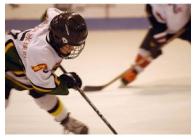
Two hockey players are fighting over the puck.