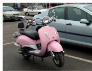
A red motorcycle parked on the side of the road.