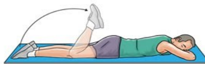
Prone knee bend