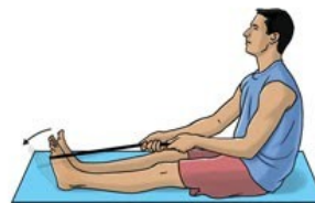
Resisted ankle plantar flexion