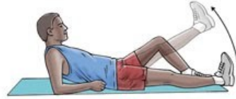
Straight leg raise