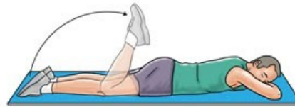
Prone knee bend