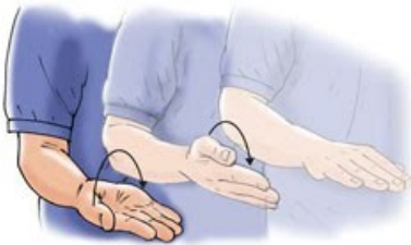
Forearm pronation and supination