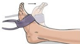
Resisted ankle dorsiflexion