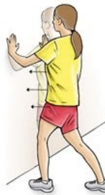
Standing soleus stretch