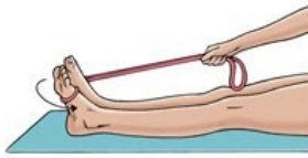
Resisted ankle eversion