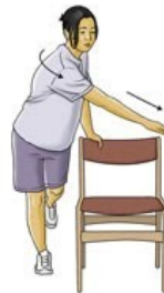
Balance and reach exercise B