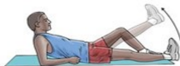
Straight leg raise