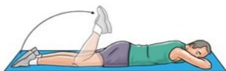
Prone knee bend