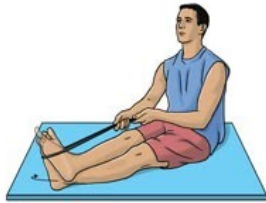
Resisted ankle inversion