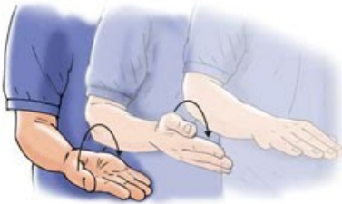
Forearm pronation and supination