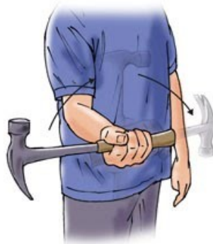
Forearm pronation and supination strengthening