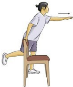
Balance and reach exercise A