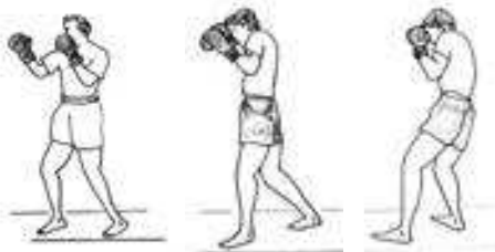
Upright stance Semi-crouch Full crouch

The modern boxing stance differs substantially from the typical boxing stances of the 19th and early 20th centuries.