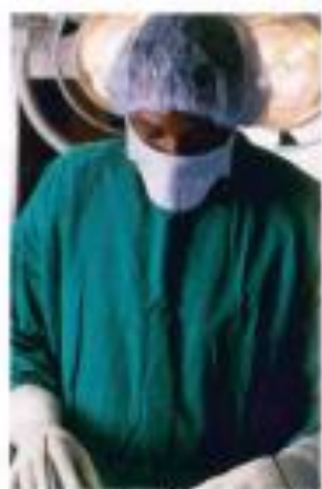
glove mask gown

Surgery is carried out in an operating theatre. Great care is taken to make sure that operations take place in sterile conditions – free from microorganisms. The surgeon and his or her assistant wash or scrub up, and put on surgical gowns, masks, and gloves. The patient's skin is prepared by disinfecting it with an antiseptic solution. This is known as prepping (preparing) the patient. They are then covered with sterile drapes, so that only the area of the operation is exposed.