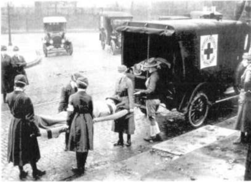
Influenza pandemic, 1918.

Of course not. Our nights are not filled with worries about scarlet fever, malaria, or bubonic plague. Cholera doesn't run rampant through our communities; river blindness, black water fever, and elephantiasis are third world exotica. Few female readers will die in childbirth, and even fewer of those reading this page are likely to be malnourished.