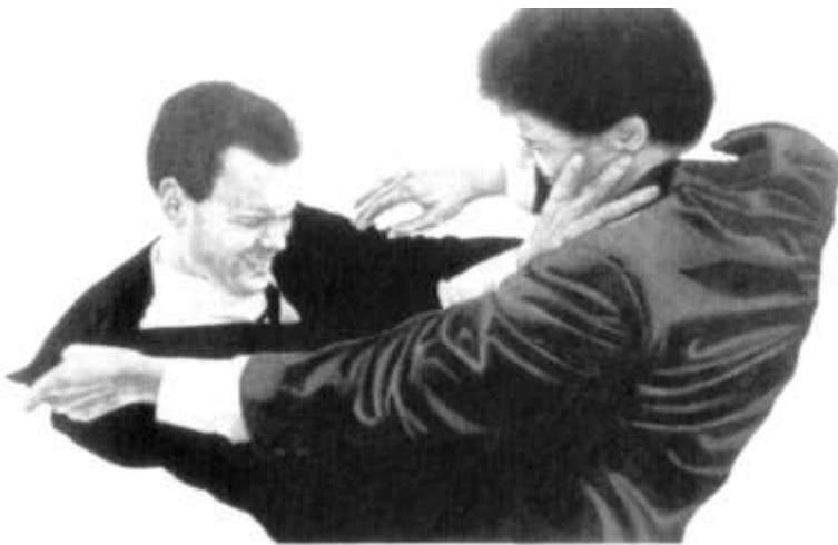
Robert Longo, Untitled Work on Paper , 1981. (Two yuppies contesting the last double latte at a restaurant?)

enough, and are smart enough, to generate all sorts of stressful events