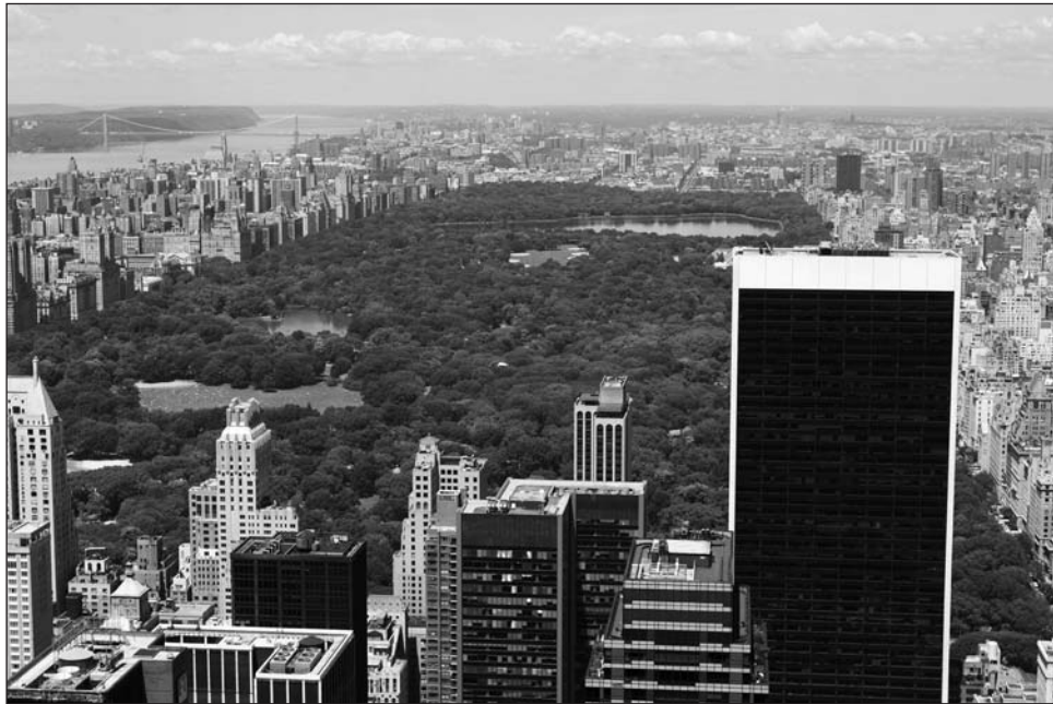
■ Central Park remains one of the great urban parks in the world. Each year over 25 million people visit the park.

All such developments did not lend themselves immediately to an emphasis on recreation. The primary purpose of the national parks at the outset was to preserve the nation's natural heritage and wildlife. This contrasted sharply with the Canadian approach to wilderness, which saw it as primitive and untamed. Parks, as in Great