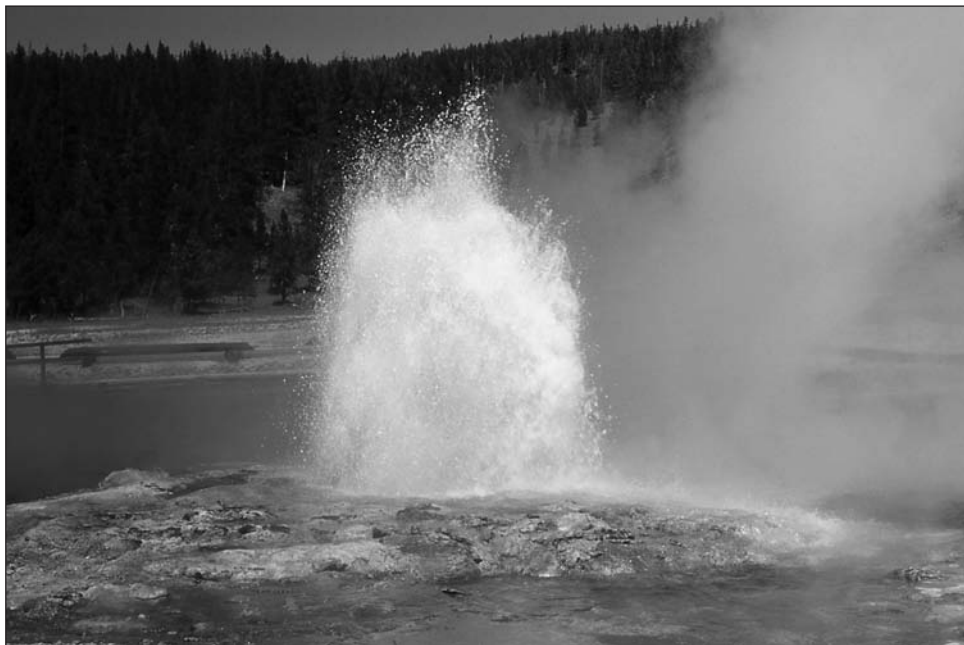
■ Old Faithful and the geysers of Yellowstone have made this first national park a popular travel destination for over 130 years.

The Lyceum movement was widely promoted by such organizations as Chautauqua, which sponsored both a lecture circuit and a leading summer camp program in upstate New York for adults and families, with varied cultural activities, sport, lectures, and other educational features. While the professed purpose of Chautauqua was education, it actually provided substantial entertainment and amusement to its audiences as well. By the twentieth century, circuit Chautauquas were formed, in a fusion of the Lyceum movement and independent Chautauquas, to provide educational programs, culture, and entertainment.