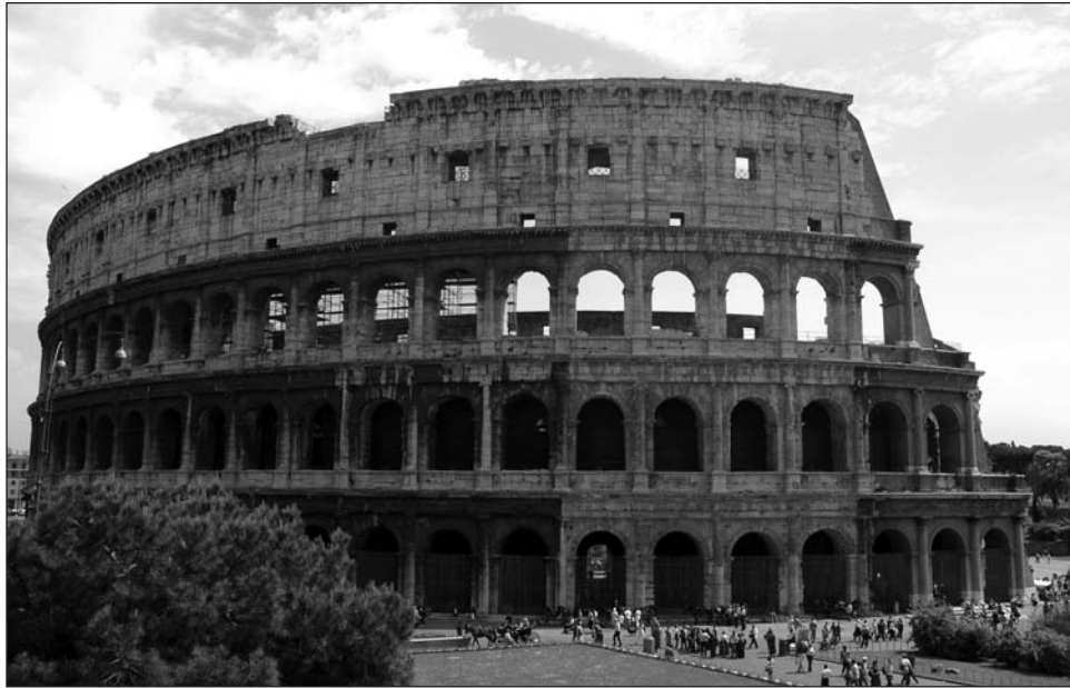
■ The Roman Colosseum is perhaps the greatest architectural achievement of antiquity. Built over 1925 years ago, the Colosseum is a monument to the achievements of ancient Rome.

interested than the Athenians in varied forms of cultural activity. Although they had many performing companies, usually composed of Greek and southern Italian slaves, the Romans themselves did not actively participate in the theater.