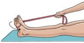
Resisted ankle eversion