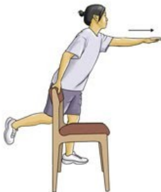
Balance and reach exercise A