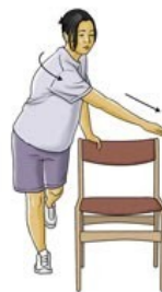
Balance and reach exercise B