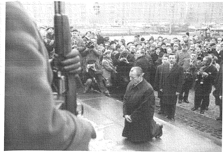
Figure 8.1 Willy Brandt kneeling in front of the Ghetto Memorial

classical theatre (Eco 1977). In contrast, television genres such as news reports or "reality TV" represent a wider scope of social reality. Here, the mediated person simultaneously refers to him- or herself both as a "real person" and to his or her social role. On television news reports he or she walks and talks not like a politician, but as a politician (Eco 1977). If, for instance, the kneeling German Chancellor is broadcasted on TV, it shows not only an actor who plays or imitates political ceremony, but someone who creates as the "real" Chancellor a new reality of commemoration by a performative act. Television's means of symbolic productions produce a multifaceted spectrum of social realities; the newer medium innovates and iterates theatre at the same time. Seen from the perspective of speech-act theory, this means that television enables real politicians to perform an act in order to transform the status or identity of the collective that they represent. In (post)modern societies teatro mundi is challenged by media mundi .