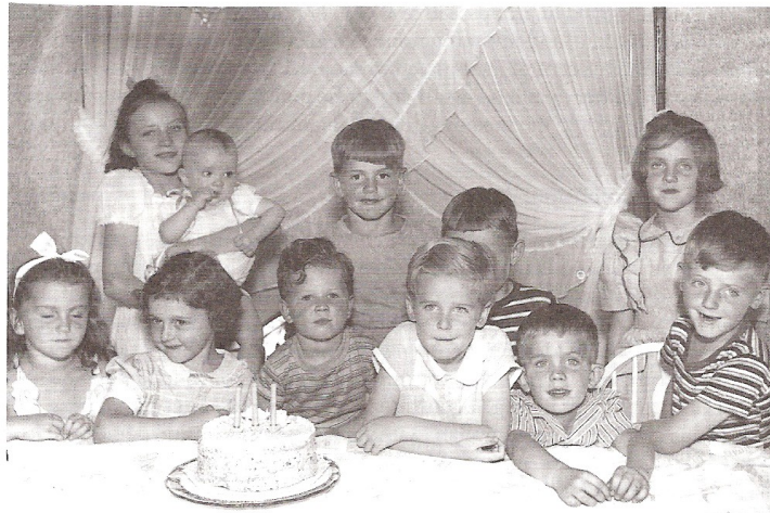
Marking the passage of years is celebrated in many cultures.

aries so rigid as numerical age (Moody, 1993). When it is possible to have two career peaks—one at age 40 in your first career, and a second at age 60 in your second career; when it is increasingly common to find people having children when they are forty—about the age at which others are becoming grandparents—the usefulness of chronological age as a life stage marker is indeed questionable.