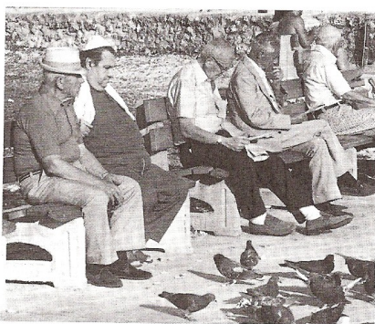
Societal aging, and its consequent increase in the proportion of older adults, requires societies to make adjustments in many areas of social life.

Beyond the “social construction” of aging, social forces influence the experience