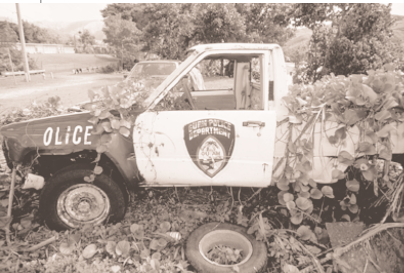
Abandoned police pickup truck, Umatac, Guam.

to provide this lifestyle to all 6.3 billion of us.