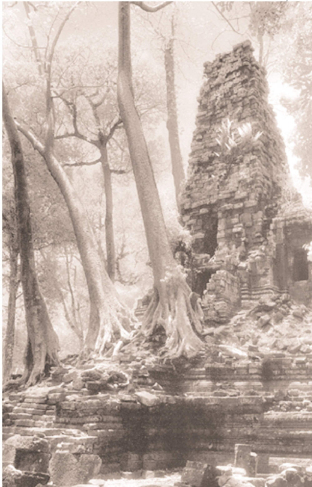
Preah Palilay Temple ruins, Angkor-Siem Reap, Cambodia.

There are two general sorts of answer to this question. The nonutilitarian answer is that every species is intrinsically valuable, regardless of what humans think about it or do with it. People can be found at all points along this spectrum of reverence for other life, from the strip-mall developer knowingly obliterating a rare orchid in pursuit of profits, to the devout Jain sweeping the ground ahead of him so as to avoid treading on an ant. But this assertion carries at least some weight with most people, and rightly so: any species can be seen as