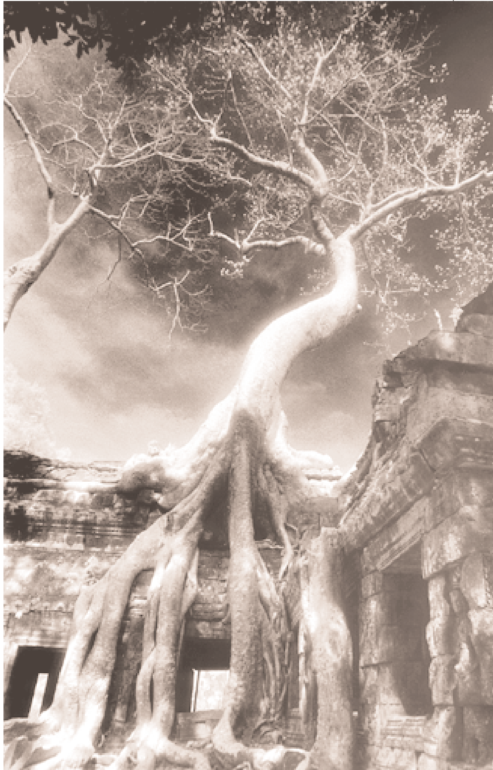
Ta Prohm Temple ruins, Angkor-Siem Reap, Cambodia.

Only the prospect of a truly sustainable culture offers the universal possibility of human fulfillment. It is the business-as-usual course that leads inexorably to a sad future of inequity, strife, natural and economic impoverishment, suffering, and cultural decline—a