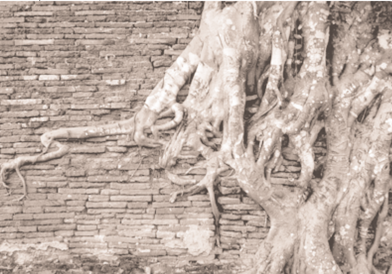
Wat Raj Burana, Thailand.