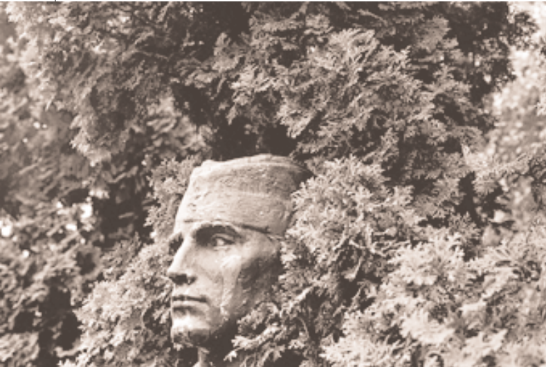
Statue among overgrown trees, Bihac, Bosnia.

one to go extinct after the most profound reflection and debate, and for the most compelling of reasons.