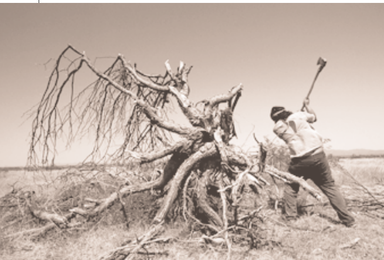
Collecting wood for charcoal, Sonoran Desert, Mexico.

According to the World Institute for Development Economics Research, income inequality increased in 48 of 73 countries surveyed between 1980 and the late 1990s. In the United States, for example, the richest 20 percent of the population earns 46 percent of the country's income, while the poorest fifth earns 5 percent. In Brazil, the richest fifth earns 64 percent of the country's income and the poorest fifth earns 2 percent. This trend may be starkest in the Brazilian city of São Paulo (population 18 million): while three million slumdweller struggle to survive, corporate executives commute to work in helicopters and live in walled suburban communities to protect themselves from the increasing urban crime.