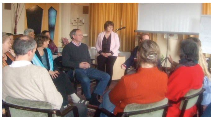
An exercise around co-creating space from a workshop

Imelda McCarthy can be emailed at imeldamccarthy@iol.ie