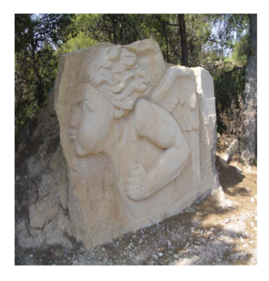
Figure 4. [In colour online.] Life projects: integrating art and landscape through sculptures in Terra Alta paths to stimulate new ways of looking and living the landscape ( The Power of Wind by Mariano Andrés).

The objective is to stimulate creator and spectator to adopt new ways of looking and living the landscape, which can help transform conventional means of creating and appreciating art: