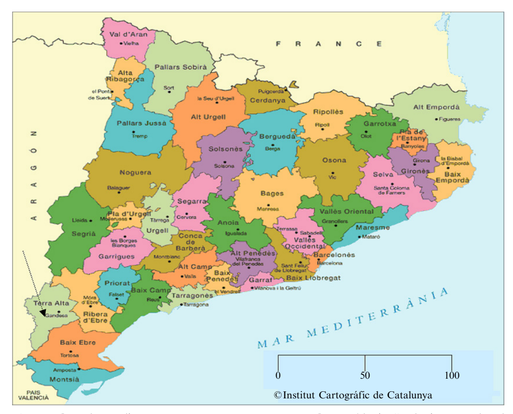
Figure 1. [In colour online, see <a href="http://dx.doi.org/10.1068/a41208">http://dx.doi.org/10.1068/a41208</a>] Terra Alta in Catalonia.

In 1989 more than 60 000 ha out of the approximately 70 000 ha of cultivable land were assigned to agricultural uses (Arrufat i Viñoles et al, 1993), mainly cultivation of vine,