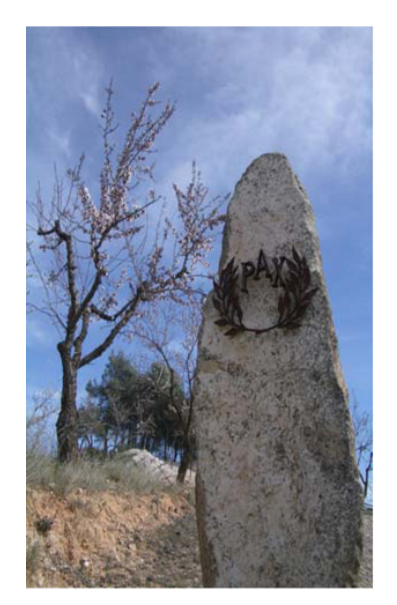
Figure 5. [In colour online.] Life projects: conserving the memory of the Spanish Civil War through monuments built on hiking trails that connect important Battle of Ebro sites.