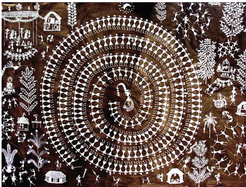
A Warli painting by Jivya Soma Mashe, Thane district

For centuries, indigenous peoples in the Andes have practiced complementarity instead of competition. This is now being lost to the penetration of the market and capital. Complementarity means a community has to join efforts with other communities in order to live and thrive. The goal is not to beat the other communities but to see how together we can