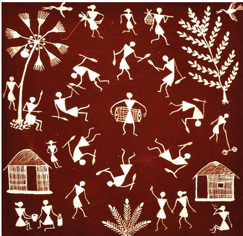
Art depicting life in a Warli community

For the Subanen of southern Philippines, preservation of culture does not mean being backwards and anti-development. Positive developments have been made in relation to women's roles. Women are seen as the main preservers of culture. Women and children are now given more recognition and voice in decision-making, and women are active leaders.