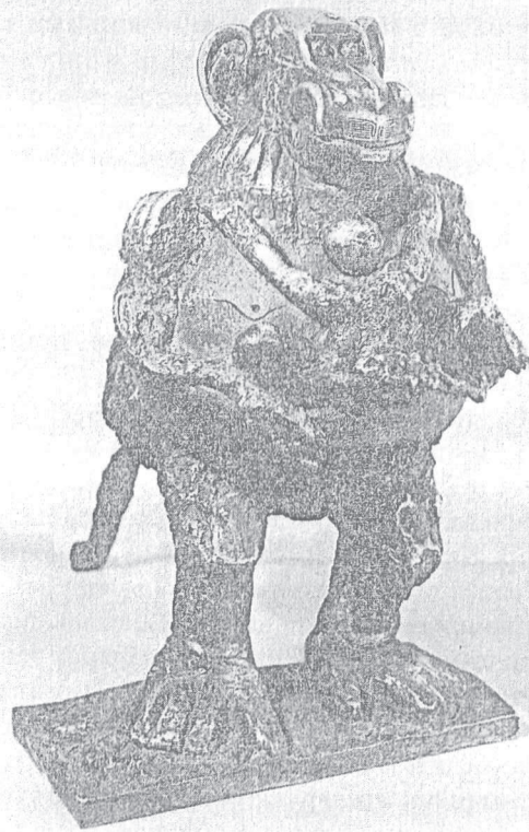
Figure 5.3 Pablo Picasso, Baboon and Young , 1950, Vallauris; bronze (cast 1955); 21 \frac{1}{8} × 14 × 7 \frac{3}{8} in. (53.6 × 35.7 × 18.8 cm); collection, The Museum of Modern Art, New York (Mrs Simon Guggenheim Fund).

Duchamp's notorious urinal, by putting them in an art exhibition and providing them with a title ( Fountain ) and an author ('R. Mutt', alias M. Duchamp, 1917). Amikam Toren, one of the most ingenious contemporary artists, takes objects like chairs and teapots, grinds them up, and uses the resulting substances to create images of chairs and teapots. This is a less radical procedure than Duchamp's, which can be used effectively only once, but it is an equally apt means of directing our attention to the essential alchemy of art, which is to make what is not out of what is, and to make what is out of what is not.