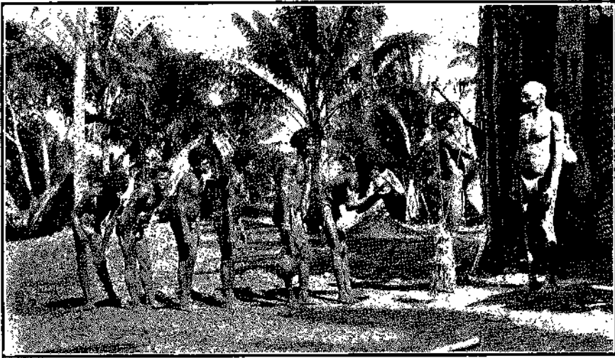
AN EPISODE IN THE INLAND KULA : OFFERING A NECKLACE ( SOULAVA ) TO A CHIEF.

KULA; THE CIRCULATING EXCHANGE OF VALUABLES IN THE ARCHIPELAGOES OF EASTERN NEW GUINEA.