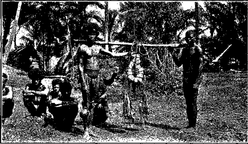
ARMSHELLS CEREMONIALLY BROUGHT INTO OMARAKANA VILLAGE FROM A SMALL EXPEDITION TO KITAVA.

The Kula has been called above "a form of trade." The usual a priori notion of savage trade would be that of an exchange of indispensable, or, at least, useful