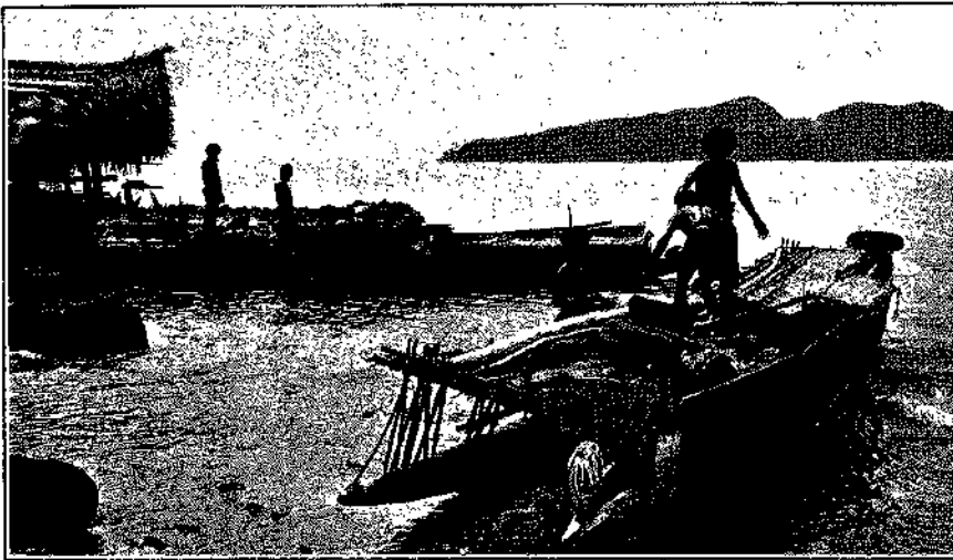
LOADING LARGE CLAYPOTS IN THE AMPHLETT ISLANDS, IN CONNECTION WITH THE KULA .

This does not exhaust the subtleties and distinctions of Kula gifts. If I, an inhabitant of Sinaketa, happen to be in possession of a pair of armshells more than usually good, the fame of it spreads. It must be noted that each one of the first-class armshells and necklaces has a personal name and a history of its own, and as they all circulate around the big ring of the Kula , they are all well known, and their appearance in a given district always creates a sensation. Now all my partners—whether from overseas or from within the district—compete for the favour of receiving this particular article of mine, and those who are specially keen try to obtain it by giving me pokala (offerings) and kaributu (solicitory gifts). The former ( pokala ) consists, as a rule, of pigs—especially fine bananas and yams or taro; the latter ( kaributu ) are of greater value: the valuable "ceremonial" axe blades (called beku ) or lime-spoons of whale's bone are given. There are further