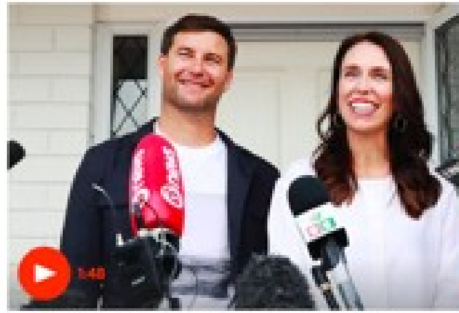
New Zealand PM Jacinda Ardern announces she's pregnant with first child - video

Labour PM says deputy Winston Peters will take over for six weeks when baby is born in June