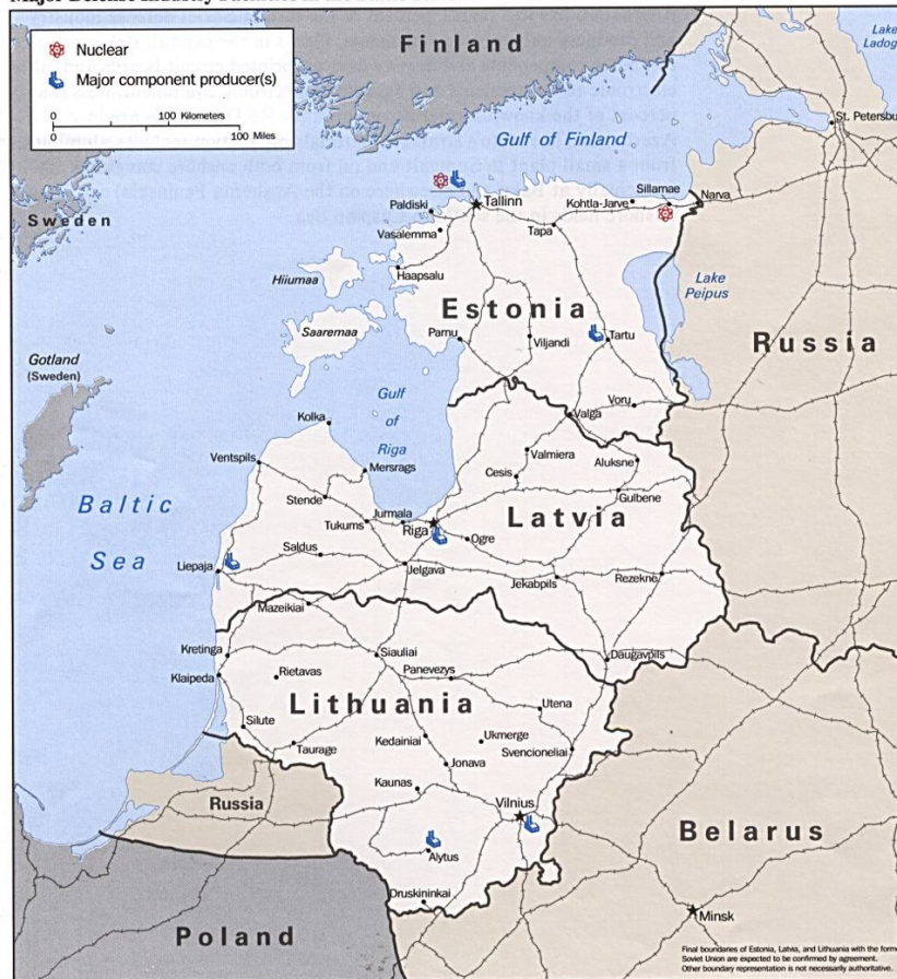
Major Defense Industry Facilities in the Baltic States