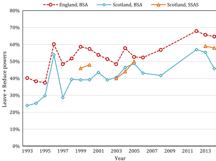
Figure 3: Euro-scepticism in England and Scotland